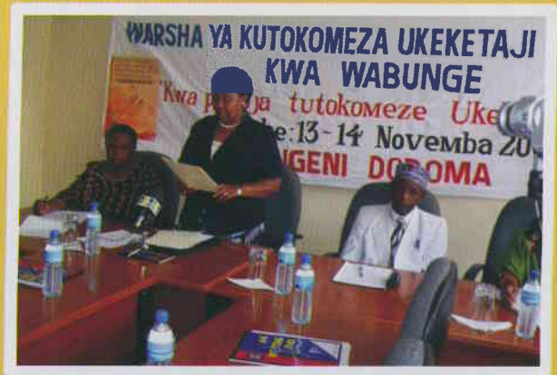
Tanzania Workshop on FGM for legislators, 2007.