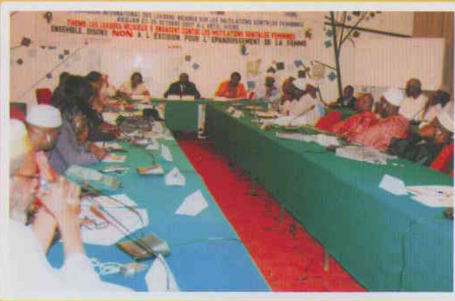
Symposium for Religious Leaders in Abidjan, Côte d'Ivoire, 2007.