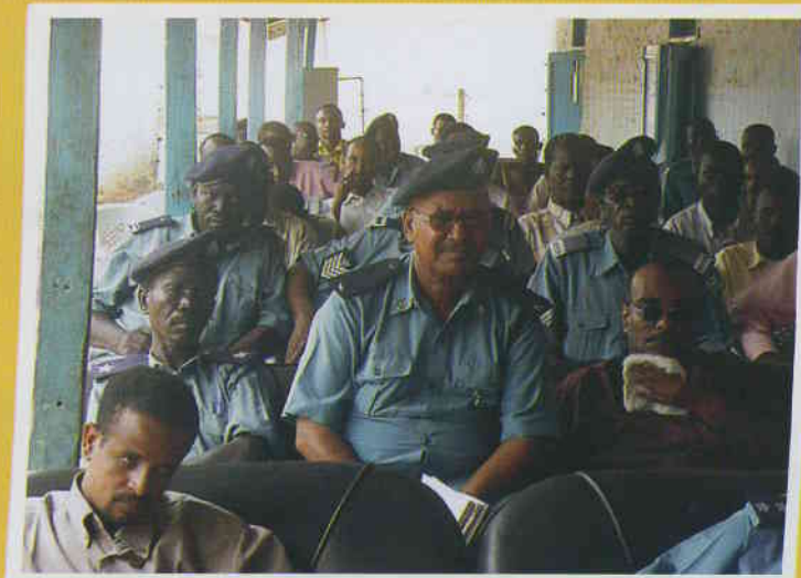
Legislators Workshop with police participants, Sudan, 2007.