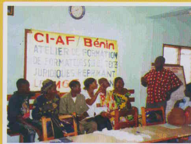
Workshop for legislators, Benin.