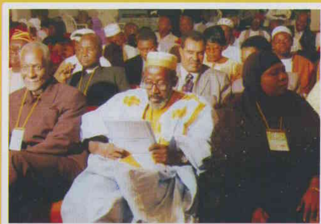
Symposium for Religious Leaders in Abidjan, Côte d'Ivoire, 2007.

Excerpts from the October 2007 Abidjan Declaration of Commitment by religious leaders: