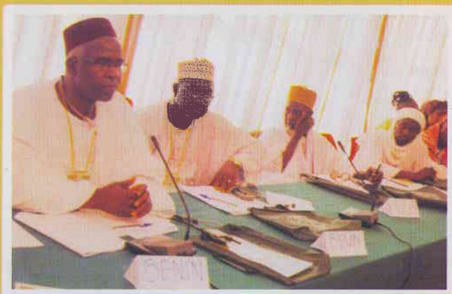
Symposium for Religious Leaders in Abidjan, Côte d'Ivoire, 2007.